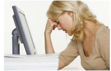
Help is here to alleviate some of your job search stress!