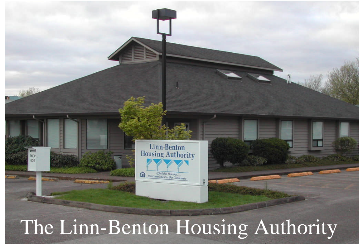
The Linn-Benton Housing Authority